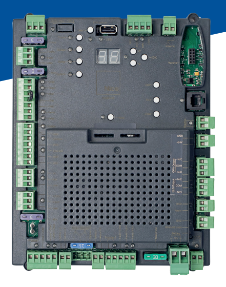
936 Control Board