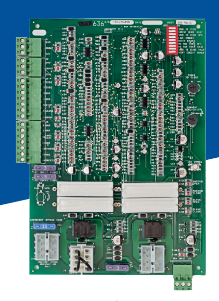
636 Control Board

An overview of our control boards and their applications