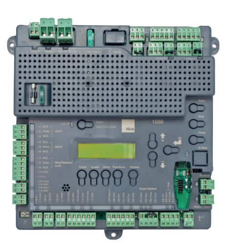
1050 Control Board