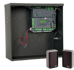
EPMB-A BlueBUS Photo Eye

Weatherproof enclosures to protect the control board and batteries