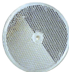
FIGURE 1-2: EMX NIR-50 325 Features

Visit https://support.hysecurity.com/hc/en-us for installation manuals, replacement part instructions, part diagrams and more. For the name of a qualified distributor near you, call Nice at 800-321-9947.