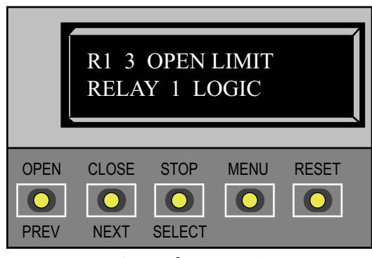
Set Relay 1 Logic

NOTE: Installer Menu options can also be configured through the use of a laptop computer and the S.T.A.R.T. software.