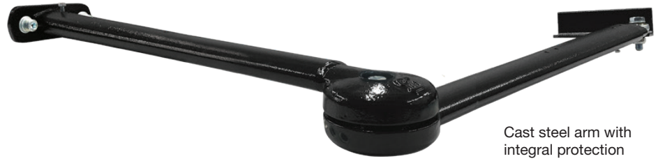
Cast steel arm with integral protection from pinch points