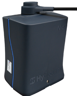
SlideSmart CNX and SwingSmart CNX require professional installation