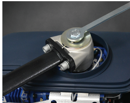
Adjustable overload protection