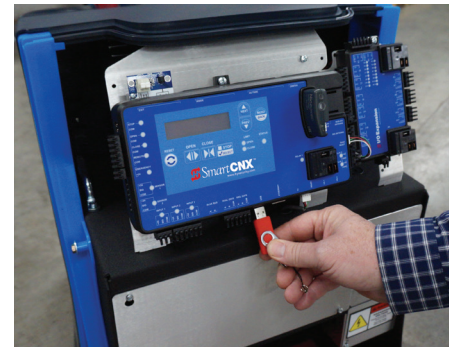
USB port for software updates and log files